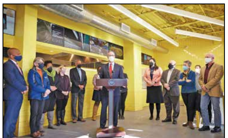
HB 345 would raise the wage but has sat in committee since April 2021. With Governor Wolf and my colleagues calling for raising the minimum wage for all Pennsylvanians.