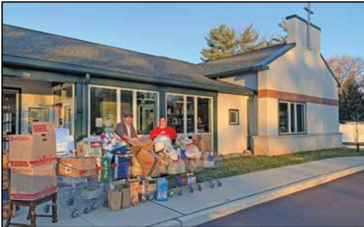
Dropping off donations at St. James Outreach House as part of my Winter Collection Drive. Donations were spread equally between St. James, Mitzvah Circle, and Daily Bread Community Food Pantry.