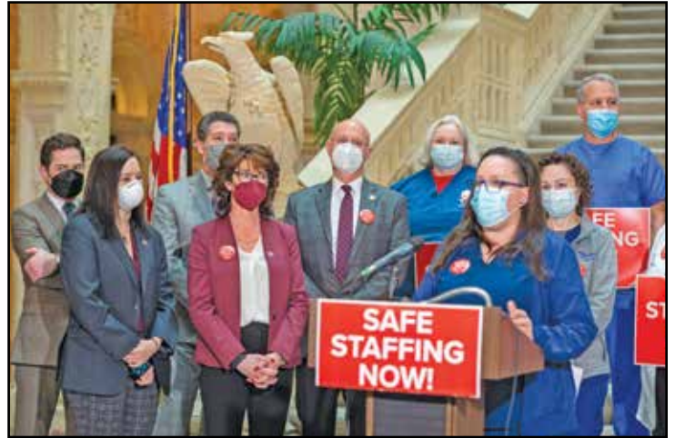
In Harrisburg calling for action on the Patient Safety Act with my colleagues and nurses throughout PA.