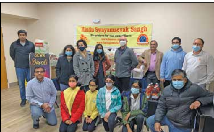
Standing with some of the members of Hindu Swayamsevak Sangh who collected hundreds of pounds of food for my Winter Collection Drive. I was so impressed with their efforts to give back to their community.